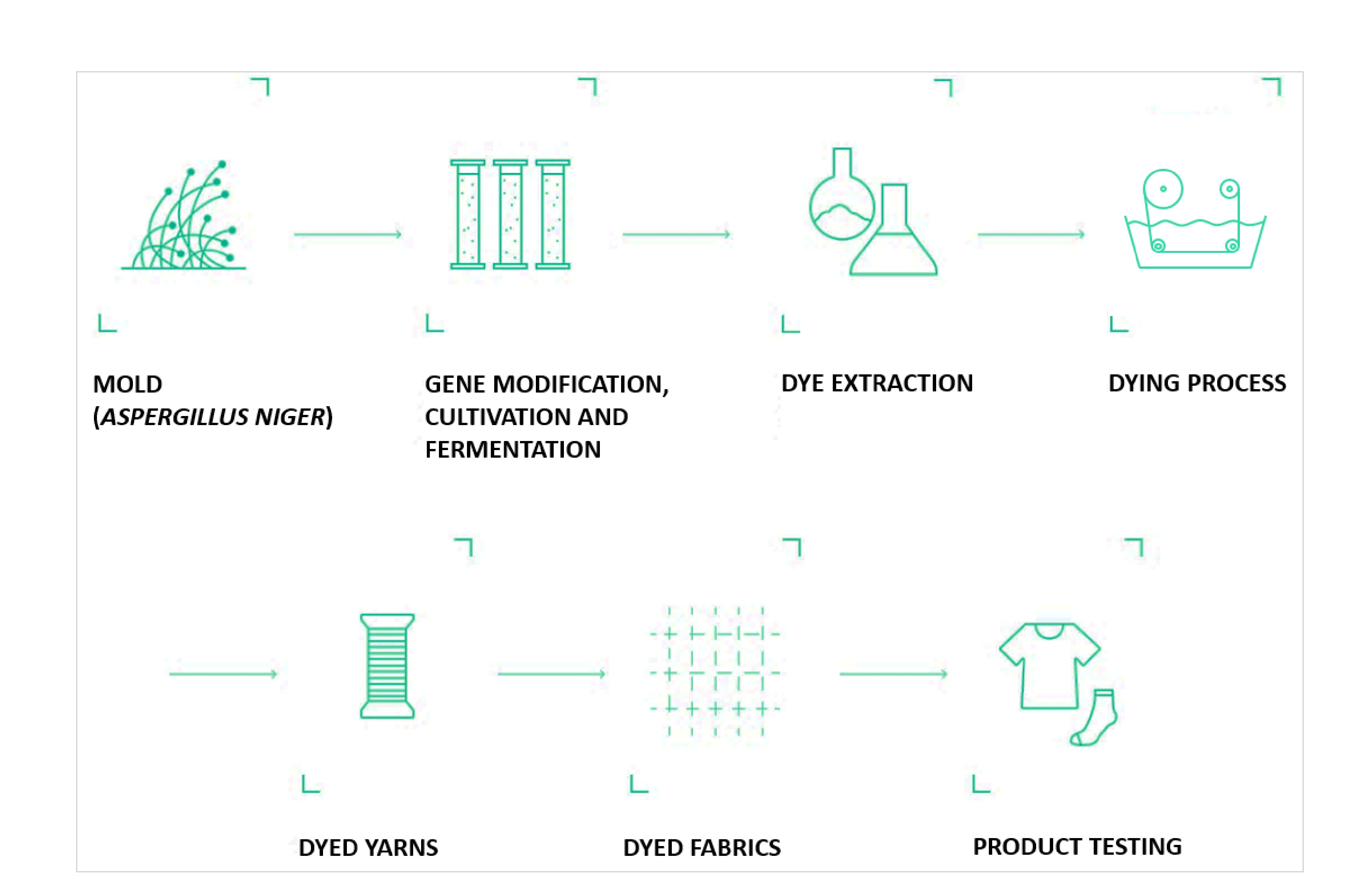
Figure 2: Schematic diagram of project objectives. This project harnesses molecular engineering to build a next generation cell factory that is hyperefficient at pigment production. This is coupled with applied science in the textile industry to test the derived pigment.